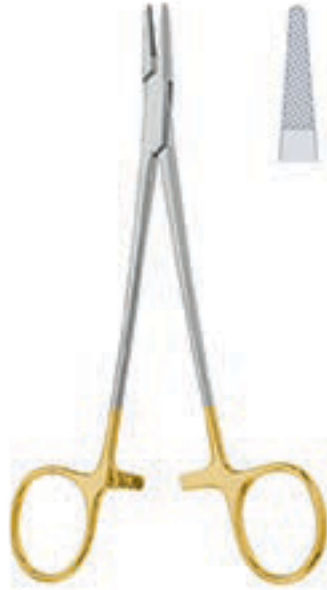
Crile - Wood