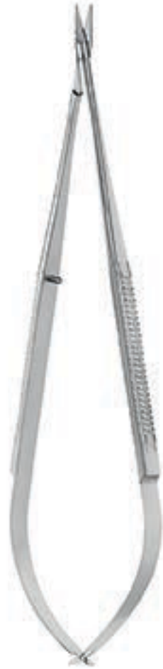
Flat handle Cutting edge 10 mm