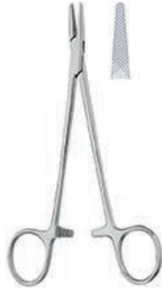
Crile - Murray