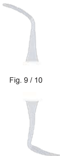
Fig. 9 / 10