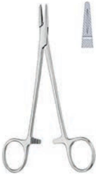
Crile - Wood