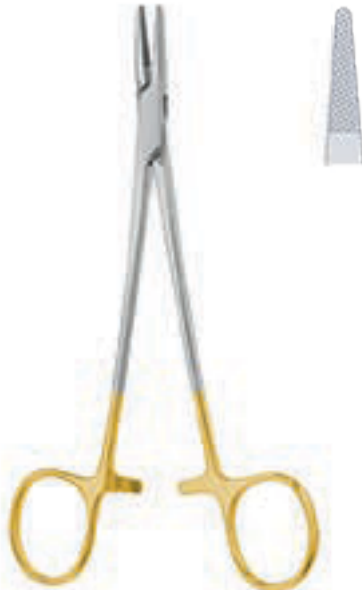
Crile - Murray