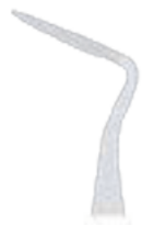
Fig. 3S / 4S